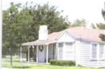
This home at 1412 West Obio is currently being renovated into a museum.

Be sure and pick up a copy of the Bush Driving Tour at the Chamber Visitors Center, 109 N. Main.