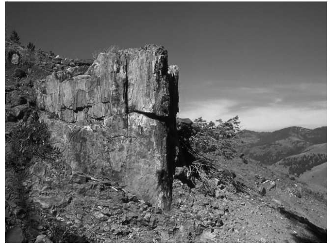
Take only photos—Collecting natural or cultural objects is illegal.

A more recent theory proposes the trees were uprooted by volcanic debris flows and transported to lower elevations. The 1980 eruption of Mount St. Helens supported this idea. Its mud flows transported trees to lower elevations and deposited some trees upright—similar to what you see on Specimen Ridge.